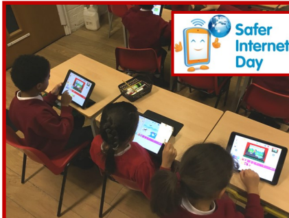
Safer Internet Day

This week, Y5 discovered what everyday life was like for Charles Dickens and his family as middle-class Victorians. Handling real Victorian household objects, Y5 explored the Dickens's family home.