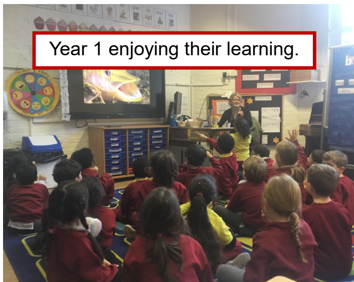
Year 1 enjoying their learning.

If you do email us your concerns we will offer to meet with you face to face and not respond by email to the issues you raise. Email is a very blunt tool and it is hard to convey deeper meaning and understanding in words on a page. Good communication and understanding relies much more on body language, tone of voice and empathy than it does in simple words and we want our communication with you to be clear, open and honest and productive.