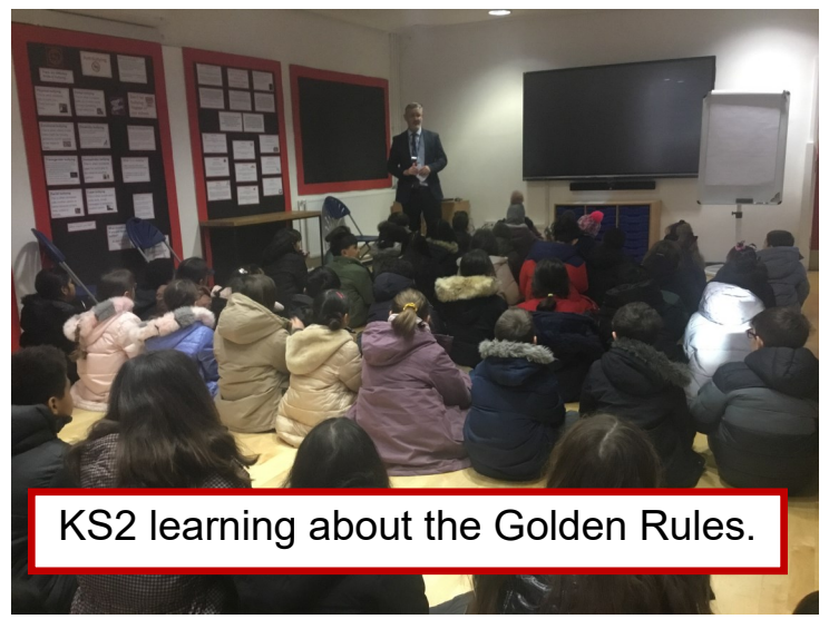
KS2 learning about the Golden Rules.

I have received and read the St James and St John CE Primary School newsletter of 08.01.2024