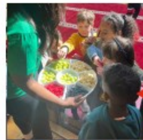
Healthy Food & Nutrition