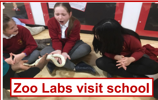
Zoo Labs visit school