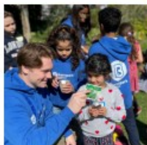
Nature & Climate