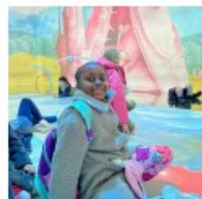
Day Trips & Enrichment