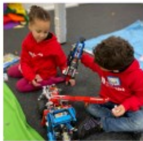
Arts, Crafts & Model-Making