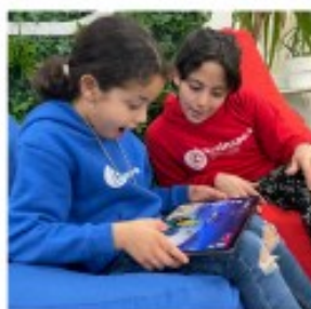
STEM & Education Games