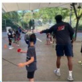
Sports & Wellbeing