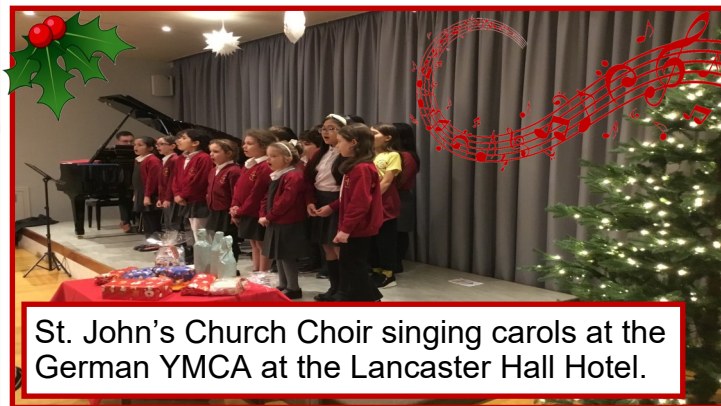
St. John's Church Choir singing carols at the German YMCA at the Lancaster Hall Hotel.

Do phone the office on 020 7504 0535 if you have any questions. We are always happy to help :-)