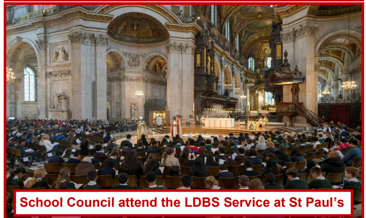
School Council attend the LDBS Service at St Paul's

This week, Y3 visited British Museum for a lively, interactive workshop to enhance their enquiry into The Bronze and Iron Age in Britain. Starting with materials from the natural world, the children investigated how people used these resources to meet everyday needs in British prehistory, handling materials to support them with their enquiry skills.